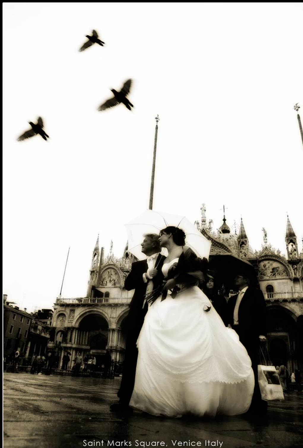
Saint Marks Square, Venice Italy