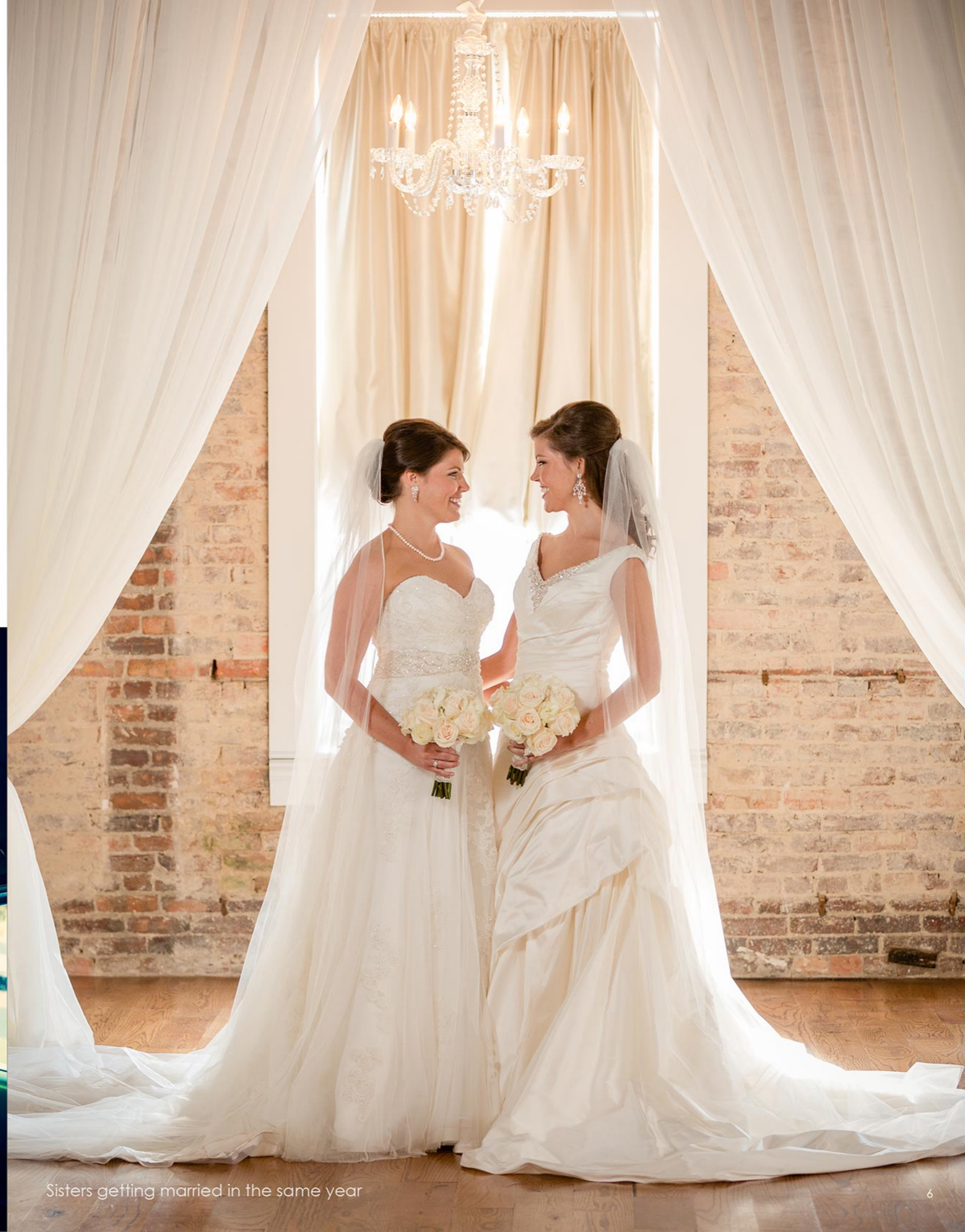
Sisters getting married in the same year